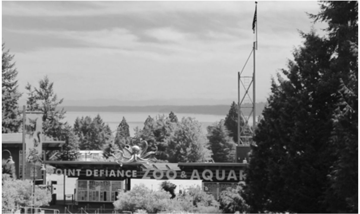
POINT DEFIANCE ZOO & AQUARIUM