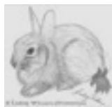
Hello From Arizona