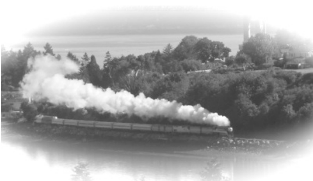
Steam Train On Tacoma Narrows by Loretta Chamberland

http://www.orhf.org/our-locomotives/sp-4449/